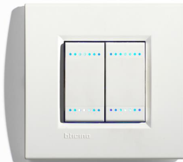
Bticino® SWC04/N Light